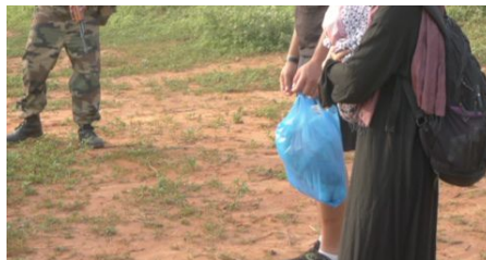
Role playing a female IDP harassed by military during flight

Work on Monitoring, Fact-finding and Reporting continued, with a meeting of the Harvard Group in April as well as the release of an article on witness protection, which can be found at: http://papers.ssrn.com/sol3/papers.cfm?abstract_id=2392493